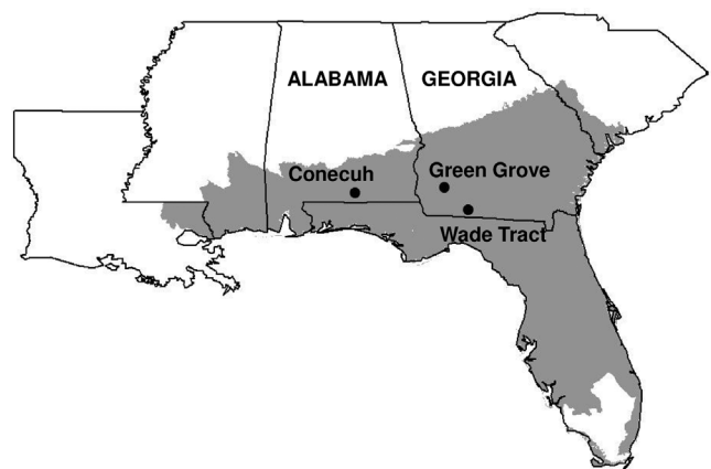
Figure 1. Location of 3 study populations in relation to the geographic distribution of the gopher tortoise (shaded area).

Green Grove is a 100-ha site located on the Jones Ecological Research Center, an 11,700-ha ecological reserve in Baker County, southwest Georgia, USA (Fig. 1). The reserve is dominated by mature longleaf pine forest interspersed with live